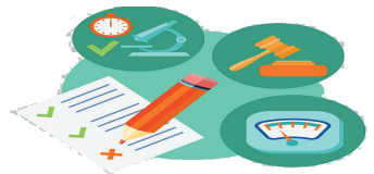
SIMPLIFIED REGULATORY COMPLIANCES